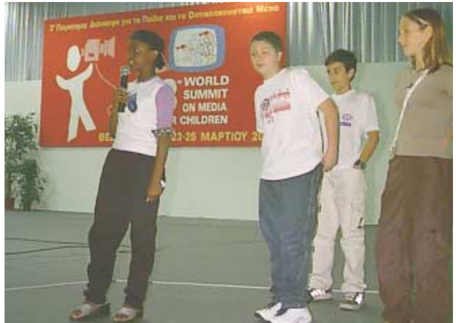
Also children had a say during the 3rd World Summit on Media for Children: the „Roaming Reporters“ at the closing event at Thessaloniki.

films for children. It was well frequented for the duration of the Summit, but when the participants were invited for some giant bottles of Ouzo, our desk suddenly became the centre of the whole event.