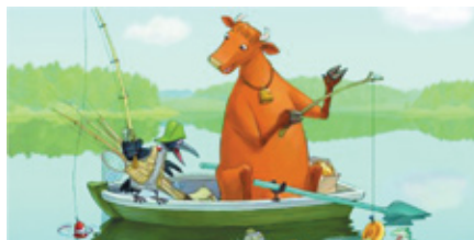
Mamma Moo and Crow