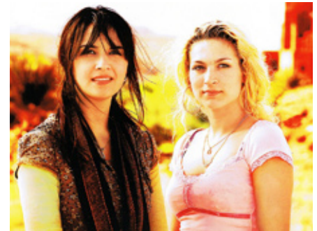
Dunya & Desie