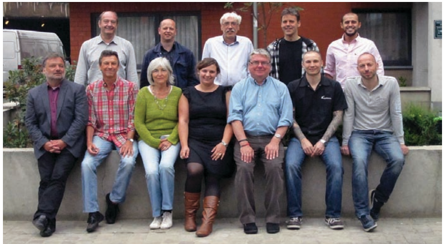
The Rainbow Project team in Brussels