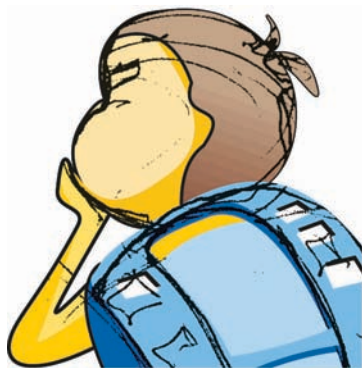
A Film in Your Backpack

year, and to have our Youngabout Festival in Bologna from March 19th – 25th, 2012. We will do our best to keep the quality as high as always and will also continue to organise our festival A Film in Your Backpack, aimed towards children aged 3-12. Our problem is that resources are scarce, and they are not distributed in an equal manner and quite often concentrated on a few members of this sector." More info: www.youngabout.com