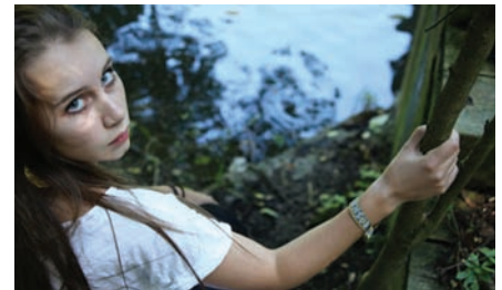
You & Me Forever