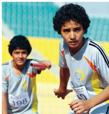
The Sound of My Foot

Khoshbakht: "Iranian family life is very warm, especially in the countryside. The film was shot in a small village near Hamadan, where families still live close together. The family atmosphere in the cities, that you might know from other films, is sometimes a bit different, but