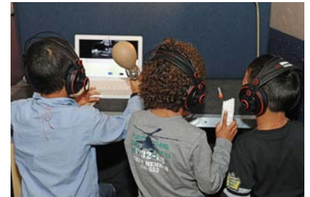
Watch that Sound