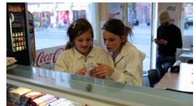
Through Ellen's Ears

On www.diversodachi.it/en/ you will find full details of the films selected on DVD (available in Italian only). More information: info@diversodachi.it . (Ivan Lo Giudice)