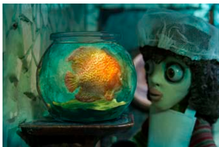
Little from the Fish Shop

Contact: Miracle Film, Nelly Jenčíková, dnelly@miraclefilm.cz ; www.miraclefilm.cz/en/index.html