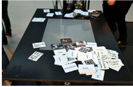
The MashUp Table: a portable on-the-spot editing device, playfully introducing an audience to the essential building blocks of cinema.