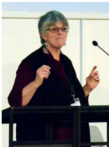
Julie Ward (Member of Parliament): "People have faced torture and prison for using media to communicate, therefore teaching youngsters how to use media is of primary importance!"

ECFA saw the need to build on this confidence by kick-starting a new era for professionals in film literacy for children. The CFF project was the first step in this process. The project concluded in a seminar in the beautiful decorum of the Royal Flemish Theatre. The program fulfilled everyone's needs, with a menu ranging from presentations to hands-on workshops, from an utterly enthused keynote speech to a manual on youngster's festival participation, and media education's latest most inspiring tools and models. Here you can find a short selection of appealing quotes: