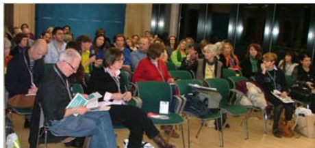
ECFA's AGM 2015

Since ECFA wants to facilitate its members with the best possible circumstances for networking, from 2016 on we'll invest in optimising the concept of the Annual General Meeting. Again this year, we're hoping to meet as many members as possible in Berlin, on Saturday 13 February, at 16.00 in a new location: the Vertretung des Freistaates Sachsen beim Bund, a 15 minute walk from Potsdamer Platz. The AGM will immediately be followed by a networking diner and an evening party at the same location, hosting the ECFA Award ceremony and a bar, handled by ECFA member Copenhagen Bombay. There is no possible reason to miss such 'ein Abend in Berlin'! More info in the next ECFA Journal.